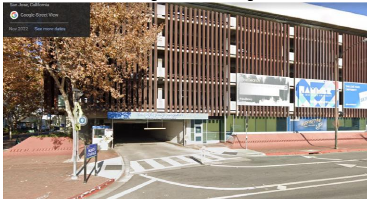
Parking Entrance Image.