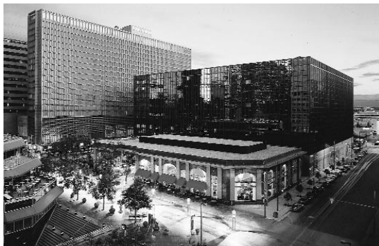
Adam's Mark Hotel, Denver, Colorado

Our headquarters is Denver's premier hotel, the Adam's Mark Hotel, 1550 Court Place, Denver, CO 80202, 303/893-3333, fax 303/626-2542. Located in the heart of downtown Denver, the Adam's Mark is within walking distance of exciting visitor locations such as the Denver Art Museum and the State Capitol, and just