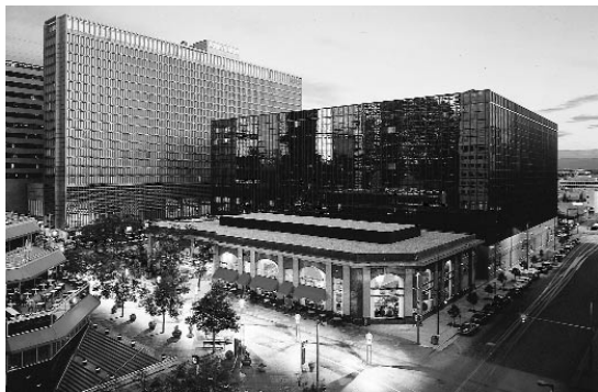
Adam's Mark Hotel, Denver, Colorado

Our headquarters is Denver's premier hotel, the Adam's Mark Hotel, 1550 Court Place, Denver, CO 80202, 303/893-3333, fax 303/626-2542. Located in the heart of downtown Denver, the Adam's Mark is within walking distance of exciting visitor locations such as the Denver Art Museum and the State Capitol, and just